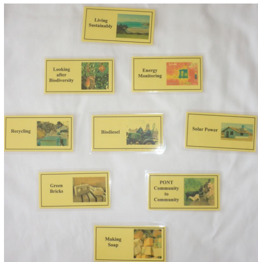
Figure 2. Ranking sustainability practices

Nevertheless it is notable that, at this first workshop in Wales, the example of teaching the module 'Living Sustainably' dominated the top of the rankings, with a project to protect biodiversity also viewed highly. The choice not to prioritise one action above others also reflected the difficulties groups encountered in agreeing the most important and their interpretation of 'importance'. Maybe it was not surprising that an initiative emphasising education for sustainability ranked consistently highly as the majority of participants are directly involved in this field. This does reiterate the importance of education in transforming actions identified by some (Orr, 1994;