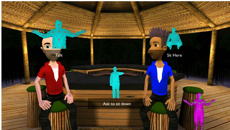
Figure : Interaction options in TRAVELLER

individualistic cultural characteristics) in the way they behave and react towards the user. The goal is for the user to gain a greater understanding of how behaviour can differ across cultures on a generic level.