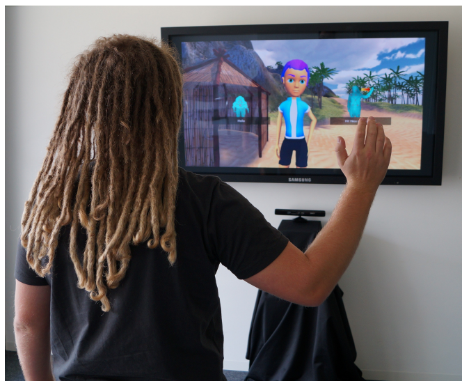
Figure : User interacting with TRAVELLER

This paper discusses Traveller, a VLE populated by intelligent agents (see figure 1), developed to provide synthetic cultures. The aim of Traveller is to help learners to develop intercultural competence following the Learning Framework (Swiderska, Krumhuber, Kappas, Degens, & Hofstede, 2011) (see table 1). This extends Bennett's Developmental Model of Intercultural Sensitivity (Bennett, 1986, 1993), through focusing on the intercultural competence traits that facilitate or moderate the development of intercultural sensitivity (Spitzberg & Changnon, 2009).