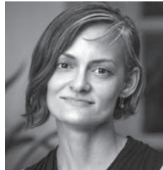
Scholars in the streets: Portraits of disruptive faculty activism in 20th-Century social movements

This SRHE funded project will allow her to investigate the transition experiences of disciplinary professional practitioners in the UK who have current or recent industry experience and are making a mid-career transition to being academics. The intention is to gain a deeper understanding of dual professional as early career academics, how their beliefs about university teaching and learning are framed and evolve, and to interrogate their beliefs about being lecturers.