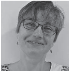
Dual Professionals in Higher Education: From Professional Practitioner to Lecturer